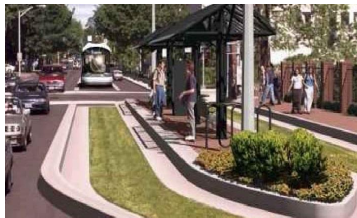
Figure 4.0 Unpaved centers of a BRT lane

These forms of BRT system- kerbside lane, Median lane and segregation lane differ in benefits. Moreover, as the investment in BRT system increases across the globe, there is also improvement on the travel speed and high quality stations. Bus lanes, indented bus stops, signal priority and regulatory signs are the simplest form of improvement of the BRT system in the world. In Canberra, Australia, kerb side lane BRT system is provided with a dedicated and continuous lane for buses to travel against the kerb edge of the road. The bus stops are fairly designed in such a way that it guarantees easy access to the surrounding streets. The main problem is when other vehicles need to cross the dedicated lane into driveways and side streets. (VTA Transit Sustainability Policy, 2007).