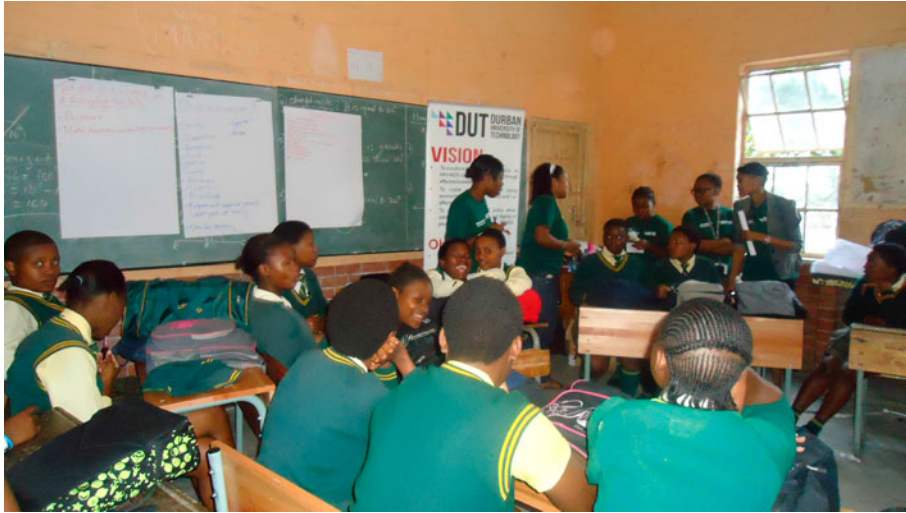
Gender Violence workshop at Imizamo Secondary School. The workshop was facilitated by both DUT and Imizamo Peer Educators

that rely primarily on cognitive outcomes or skills in academic literacy.