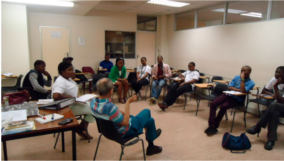
The DUT and Imizamo Peer Educators in a gender violence discussion and debriefing session facilitated by The International Centre for Non-Violence (ICON)

township, a large township outside Durban. The school is an all-African quintile 1 1 township school located in an environment mostly made up of informal housing and low-cost housing built by the then apartheid government, as well as post-apartheid Reconstruction and Development Programme (RDP) housing comprising small two- and three-roomed houses. As a quintile 1 institution, the school was a 'no-fee school' and relied largely on government subsidies and donations. As a result the school is characterised by poor infrastructure, which bears testimony to the socio-economic demography of the learners it attracts.