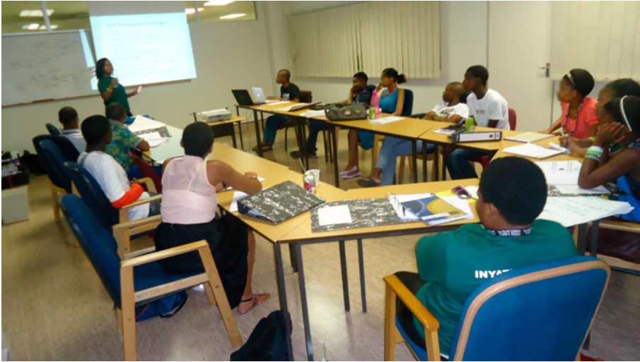
DUT and Imizamo Secondary School Peer Educators in one of the workshops at DUT

wait for her in the sun " (Sourced from facilitator notes).