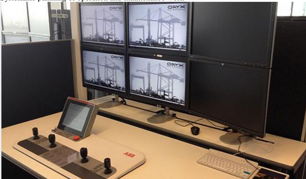
Figure 1: remotely controlling ship-to-shore cranes