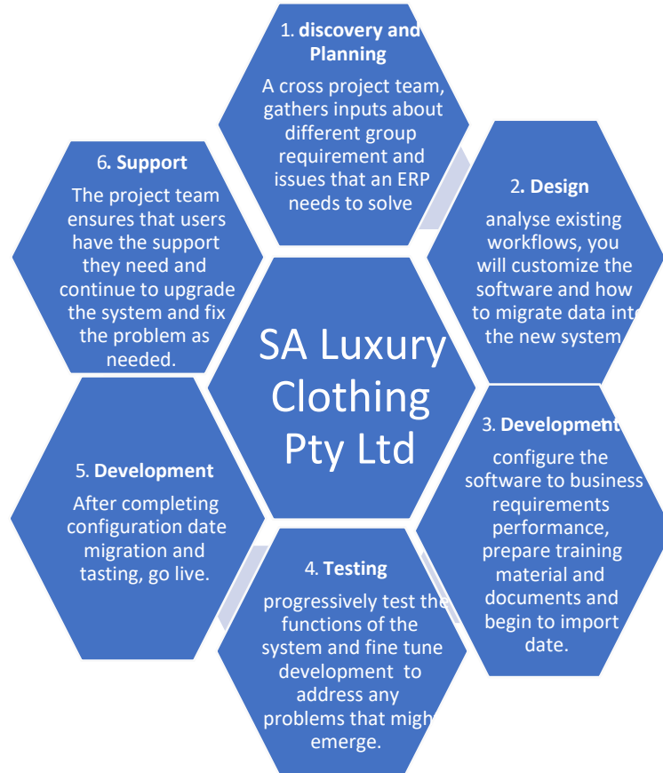
Figure 1. The 6 basic phases of an ERP implementation plan

Implementing an ERP system offers many benefits for various businesses. It enables departments to operate simultaneously and assists in the storage of data in a single database. The implementation of ERP integrates all the departments, including customer service, human resources, supply chain, accounting, finance, and inventory management, and enables them to collaborate.