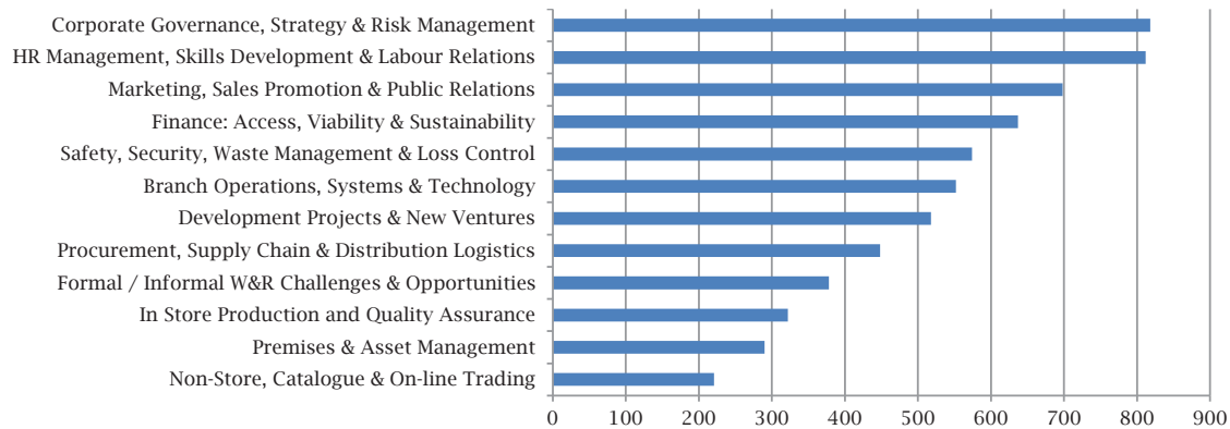
Figure 1. Overall W&R sector survey findings: national research priorities

For each of these priority areas, a number of research topics were identified from the overall responses - these were termed "Burning Issues" for priority in-depth research.