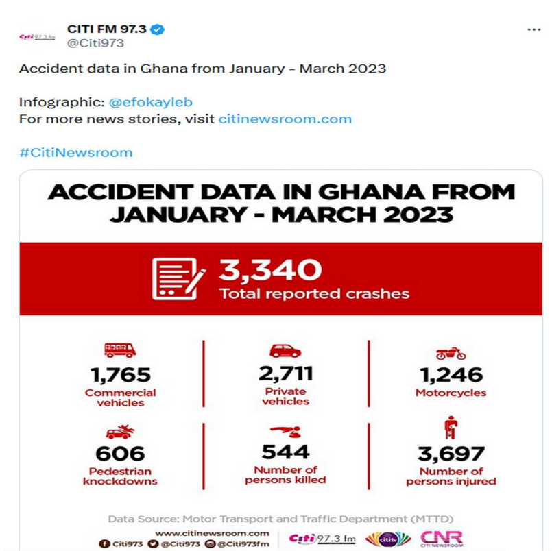
Figure 2. X post by @citi973 on accident data in Ghana.