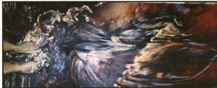
Figure 19: Going with the flow: Engagement