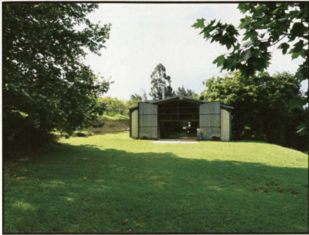
Figure 5: The Venue from the outside