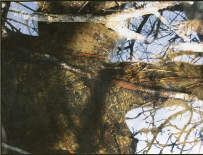
Figure 11: Path Reflected 1