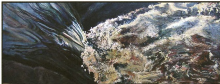
Figure 20: Going with the flow: Fear