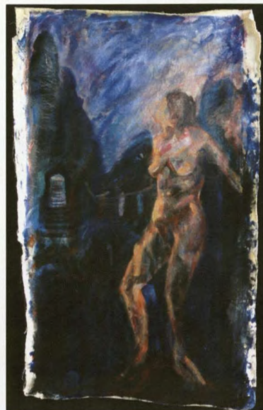
Figure 16: Looking back