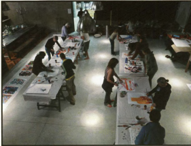
Figure 1: Warm-up experience

(Refer to List of Illustrations on page vii for details)