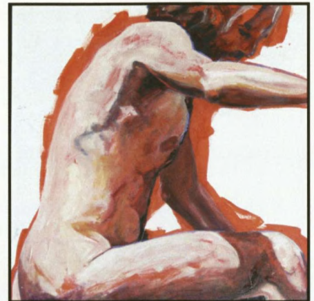
Figure 22: Forward