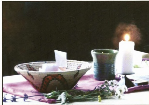
Figure 3: Centre piece