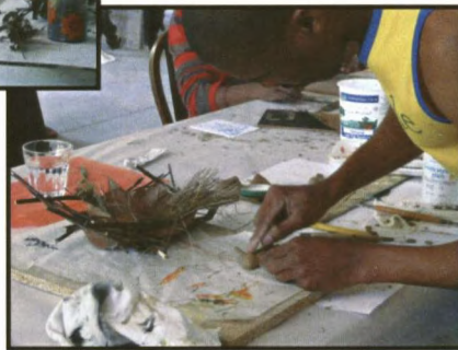
Figure 7: Participants inspired by nature