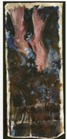
Figure 17: Kick start