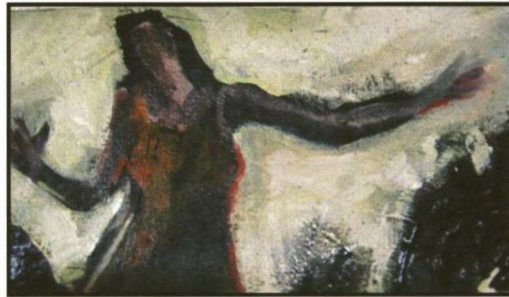
Figure 13: Fragment 1