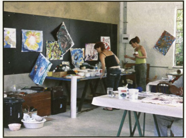
Figure 2: Material tables