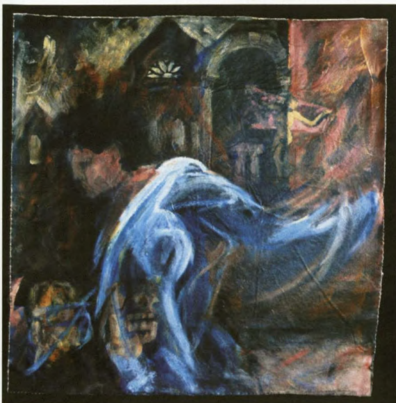
Figure 15: Chaos – A dance of discovery