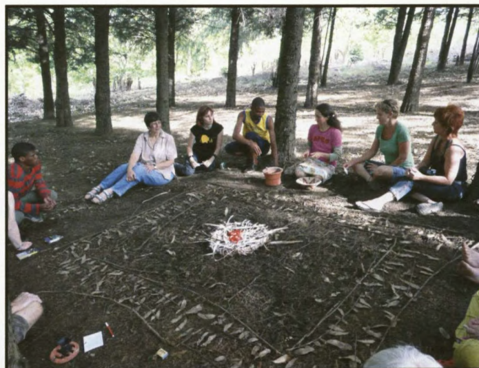
Figure 9: Closing ceremony