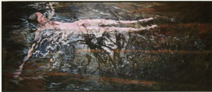
Figure 18: Going with the flow: Surrender