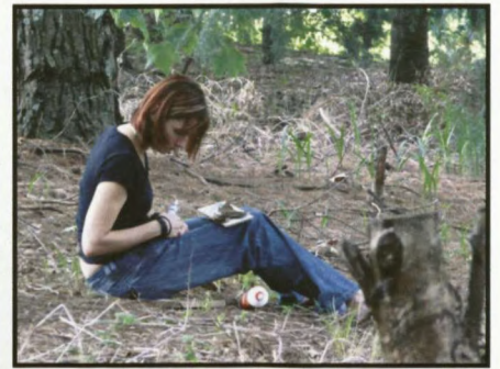
Figure 4: Participants gathering inspiration from nature