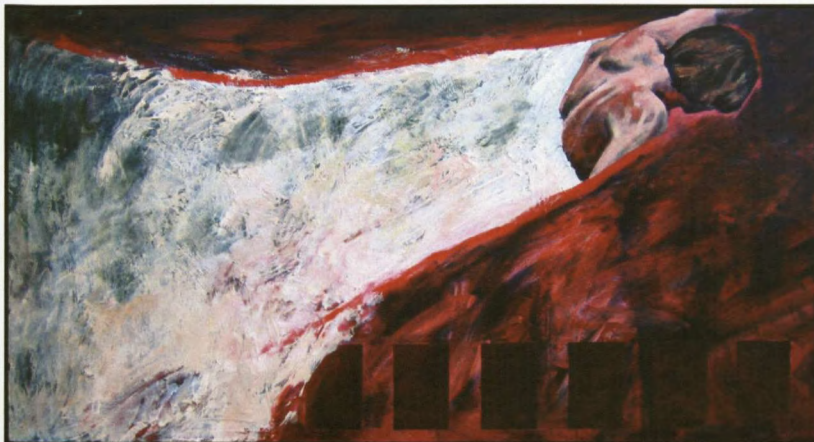
Figure 21: Forging a path