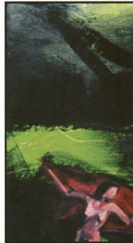
Figure 14: Fragment 2