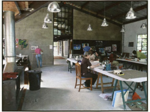
Figure 6: Inside the venue