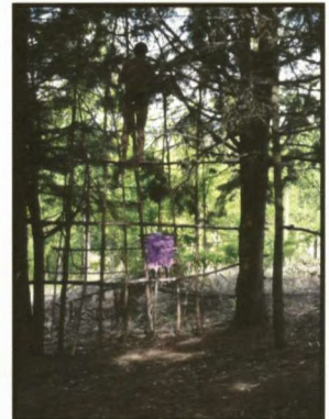
Figure 8: Installation in natural environment