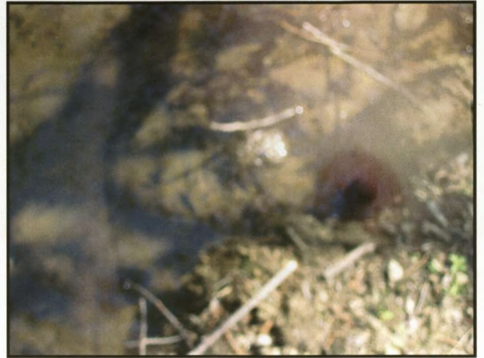
Figure 12: Path Reflected 2