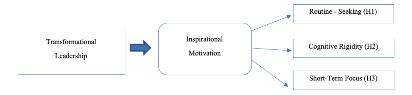
Figure 1: Conceptual Model

Having discussed the theory considered for this study, the next section deliberates on the methodology employed.