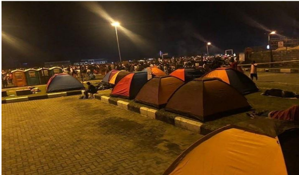
Figure 6: #EndSARS protesters camping at the Lekki tollgate; Source: Ajayi, 2020.

The Nigerian government, rather than address the numerous demands of the protesters, again announced a change of the unit's name, from the Federal Special Anti-Robbery Squad (FSARS) to the Special Weapon and Tactical Team (SWAT). This announcement was met with displeasure from the masses protesting on the streets as they saw the announcement as a media tactic to silence them and to make them leave the streets. The protests continued despite the announcement. The sleeping and camping also continued for two weeks following the October 1, 2020 Independence celebration. During the first two weeks, the #EndSARS hashtag gathered momentum on social media, and on Twitter especially, with the daily use of the hashtags in reporting the atrocities of the men of the FSARS, now SWAT. This caught the attention of the founder and CEO of Twitter, Jack Dorsey, who afterwards gave the #EndSARS hashtag a Nigerian flag, so that whenever a user typed/tweeted '#EndSARS', the Nigerian flag would appear right after it. A special Bitcoin account was also created by Jack Dorsey, Twitter's former CEO, to support the protests (Dorsey, 2020). (See Figure 7 below).