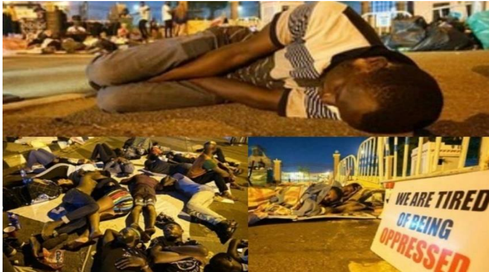
Figure 5: #EndSARS protesters asleep at the Lekki tollgate; Source: Natty, 2020.