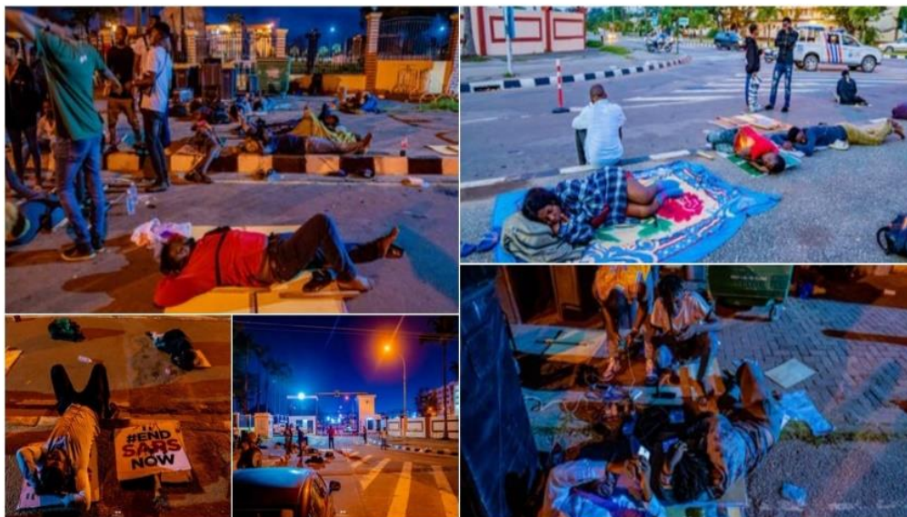
Figure 4: #EndSARS protesters sleeping at the Lagos House of Assembly

The protests venues, as mentioned earlier, were communicated on social media platforms and people attended these protests in their thousands both throughout and outside the country. Some of the converging points of the protests in Nigeria were the Nigerian National Assembly complex in Abuja, the Lekki tollgate in Lagos, and other strategic locations in the country. The protesters at some of the protest sites were seen to sleep there for days, waiting for the government to respond to their demands. Protesters conducted Friday and Sunday services for Muslim and Christian worshippers respectively at these venues. The figures below indicate protesters sleeping and camping at the Lagos State House of Assembly and at the Lekki tollgate: