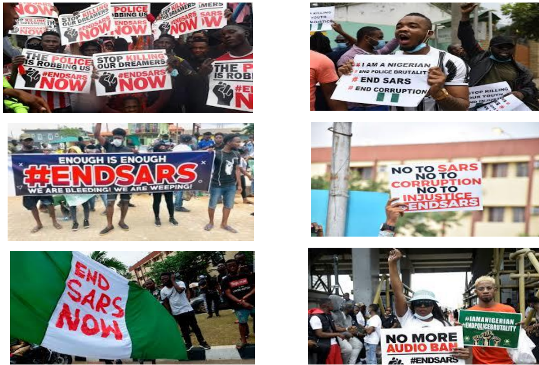
Figure 3: #EndSARS protesters with different placards

The protests venues, as mentioned earlier, were communicated on social media platforms and people attended these protests in their thousands both throughout and outside the country. Some of the converging points of the protests in Nigeria were the Nigerian National Assembly complex in Abuja, the Lekki tollgate in Lagos, and other strategic locations in the country. The protesters at some of the protest sites were seen to sleep there for days, waiting for the government to respond to their demands. Protesters conducted Friday and Sunday services for Muslim and Christian worshippers respectively at these venues. The figures below indicate protesters sleeping and camping at the Lagos State House of Assembly and at the Lekki tollgate: