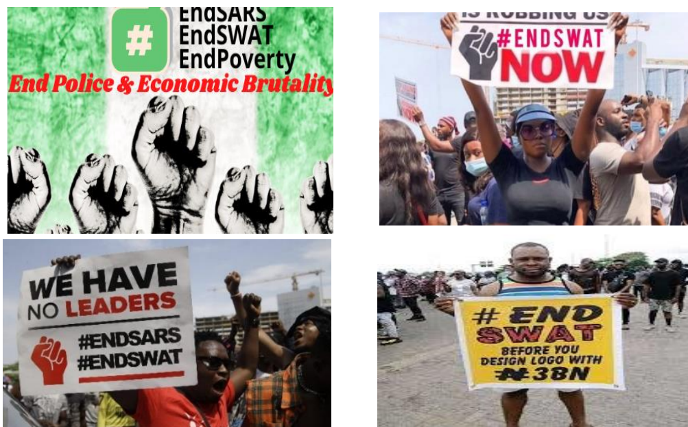
Figure 8: New protests hashtags; Source: Eco Information 2020; Anwana, 2020; Tero 2020.

Immediately following the announcement of the unit's name change from SARS to SWAT, new hashtags emerged on the social media platforms such as #EndSWAT, #EndSWATNow, #EndPoverty, and so on (See Figure 8 below).