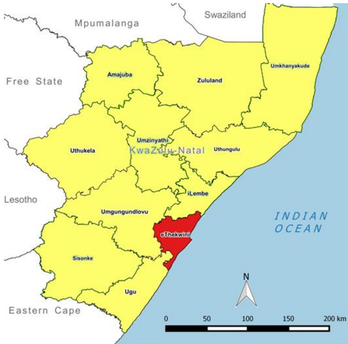
Figure 3.1 Map of KZN showing the districts (Geohealth n.d.).

Public healthcare facilities in South Africa are structured according to a hierarchical referral system, and are classified according to the different categories corresponding to the services they are capable of rendering to patients (South Africa, Department of Health 2012: 35-37). Clinics, community centres, as well as district hospitals offer the most basic services, and are classified as Level 1. Regional hospitals are Level 2, provincial tertiary hospitals are Level 3, and the most comprehensive services are offered at Level 4, which has central hospitals and specialised hospitals (South Africa, Department of Health KZN 2017: para. 1 line 1). Imaging facilities may be found in hospitals at all these levels. Alternatively, hospitals may be differentiated by their different classifications, as explained by